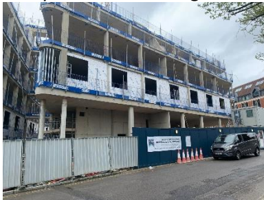
Facade Infills & Windows pre brickwork

All environmental monitoring equipment situated on site remains live and is being recorded and is always monitored alongside Cambridge City Council.