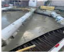
First Ground floor pour