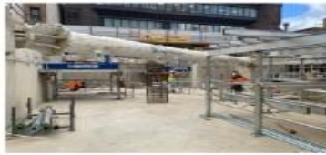
Beginning of prop removal ground floor