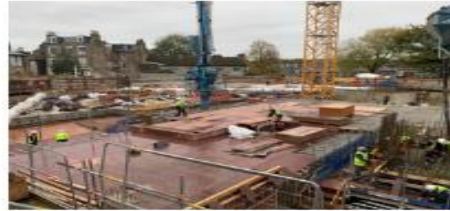
Falsework decking for remaining ground floor pours