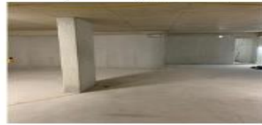
Car park level -3