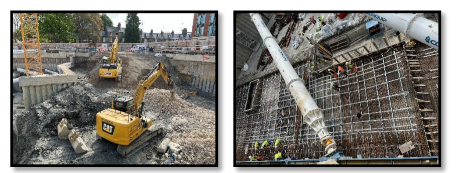
Round Church St bulk excavations & basement slab preparations