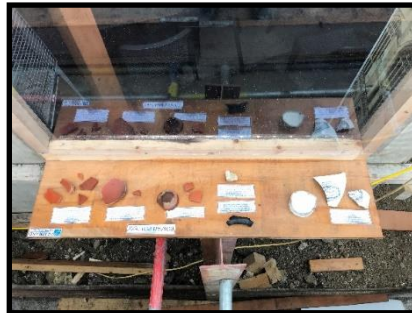
Archaeological finds on display at The Maypole