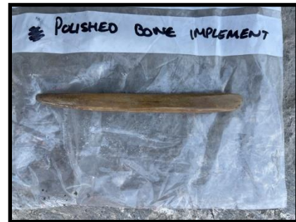
Archaeologists Works in Progress