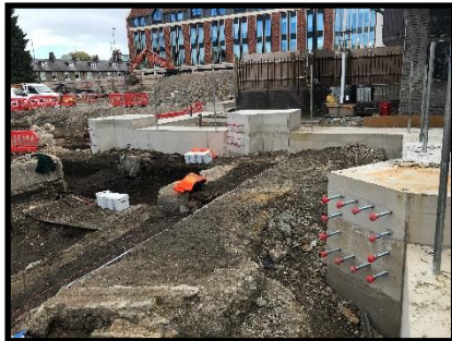
Perimeter Capping Beam