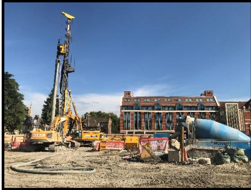
Piling rig and equipment in operation