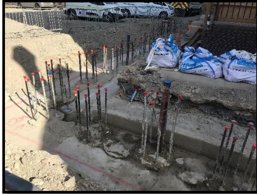
Top of secant pile wall prepared and ready for steel fixing, formwork and concrete placement.