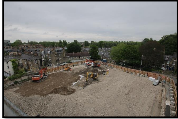
Processing of demolition arisings and preparation of formation levels & piling mat