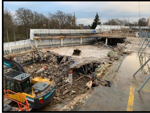
Demolition jaws pulverising & removing slab sections floor bay at a time