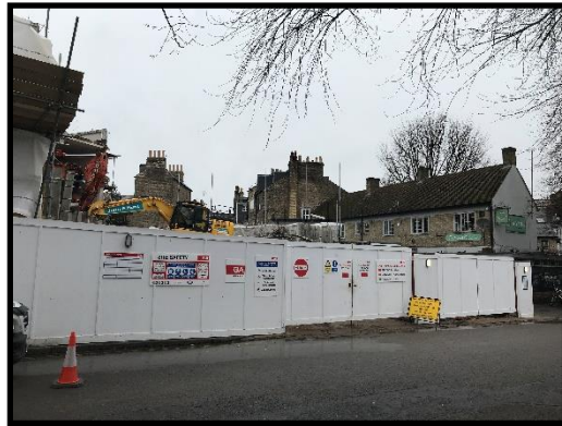
Park Street view of the demolition progress.